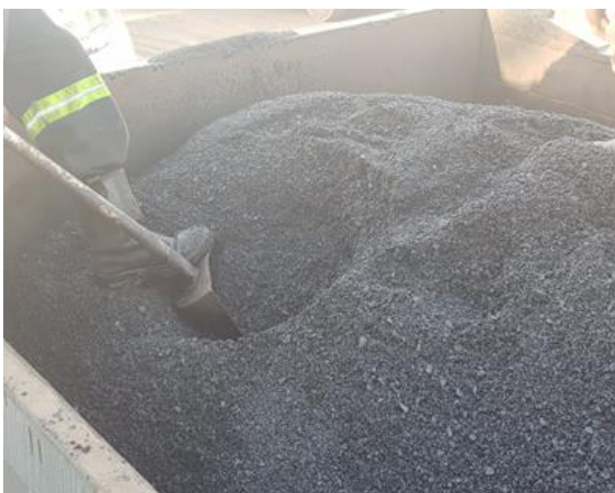
Figure A6: Using a Scoop-Type Shovel, the Sample is Procured