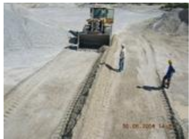
Front end loader levelling second (adjacent) bucket load