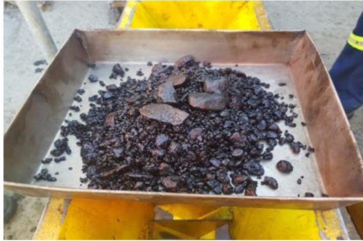
Photo 10 - The test sample