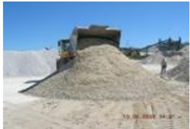
Front end loader tipping bucket of granular material away from stockpile