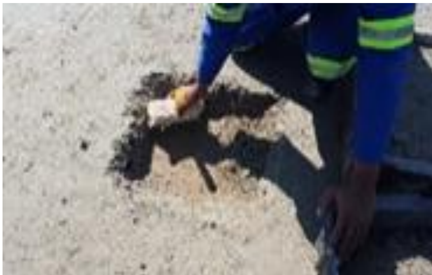
Figure A11: Brushing all Remaining Fines for Collection