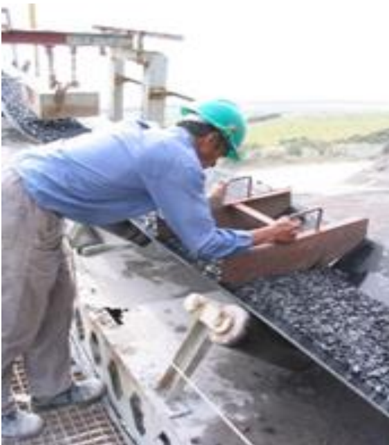
Sampling templates placed in position on halted conveyor belt