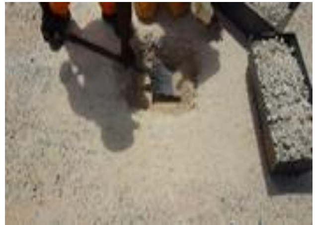
Figures A10 (a) and (b): Extracting all Loose Material and Transferring to Containers