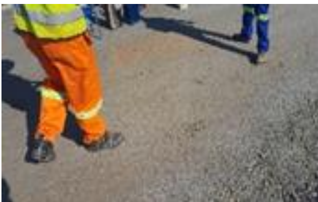
Figure A8: Typical Compacted Unstabilised Granular Layer from which a Sample will be taken, marking the Sampling Position