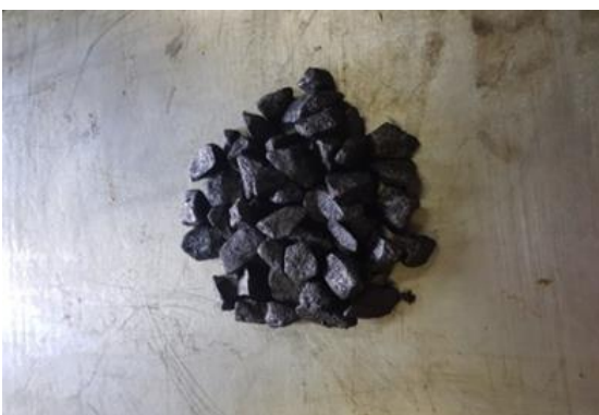
Photo 5 - Forming the material into a cone, then pressed flat