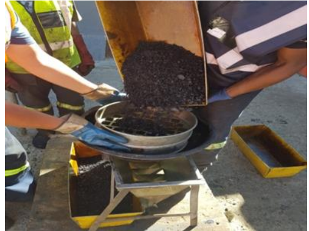
Photo 2 - Sieving extra-large particles