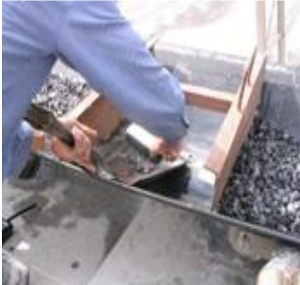
Brushing all fines remaining on conveyor belt