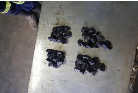
Photo 7 - Dividing material into four quadrants