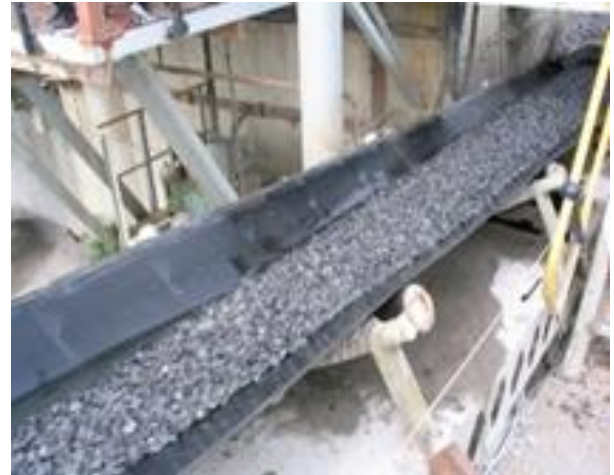
Material on conveyor belt