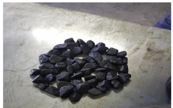
Photo 6 - Pressing the coned material flat