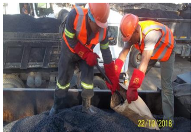
Figure A7: Asphalt Sample being Placed in a Sample Bag