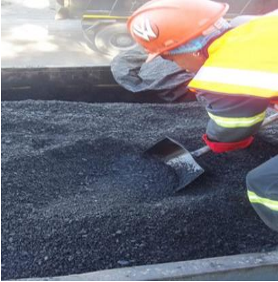
Figure A4: Setting the Crust of the Asphalt Aside and Digging into the Pile