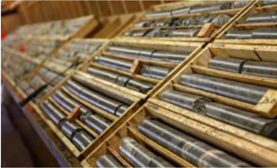
Figure A12: Wooden Sample Boxes with Samples carefully placed