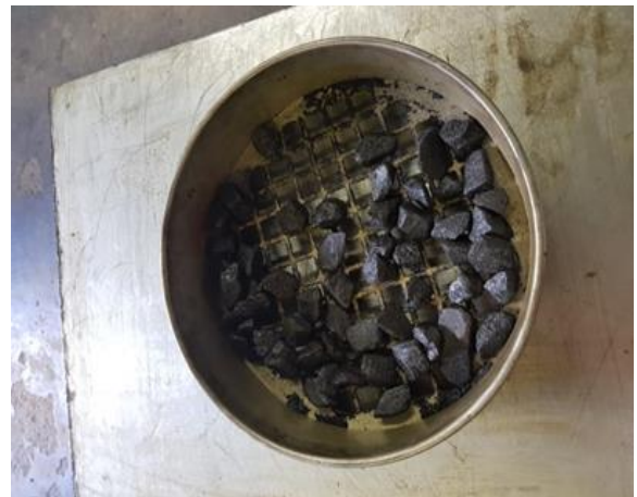
Photo 4 - Extra-large size particles on sieve being prepared for sub-dividing by coning and quartering