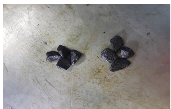
Photos 9 (a), (b), (c) and (d) - Continuing the process of coning and quartering