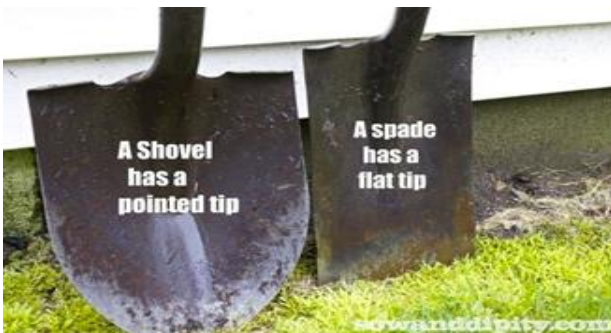
Figure A1: Sampling Shovel with Pointed Tip and Flat Spade with Flat

i. A spade with built-up sides (shovel) see figures 1 and 2.