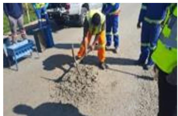
Figure A9: Using a Pick to Loosen the Material and Dig through the Entire Layer