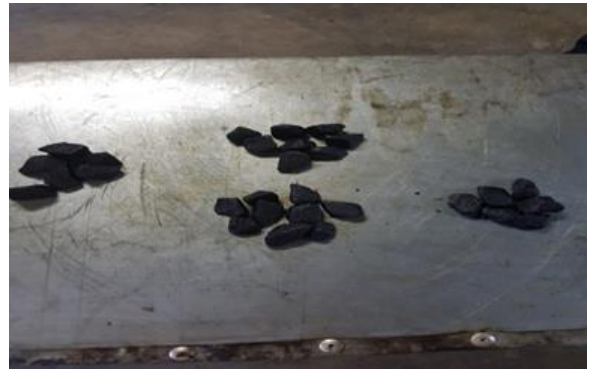
Photo 8 - Rejecting the two opposite quadrants