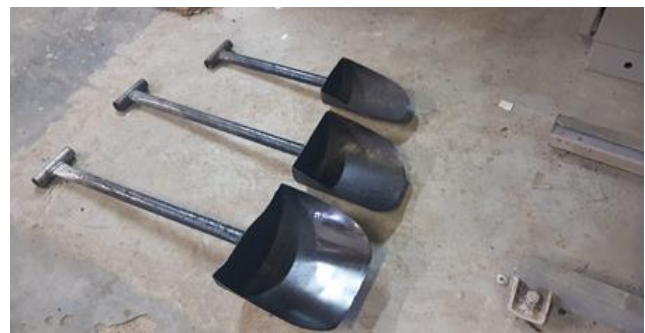
Figure A2: Large, Medium and Small Scoop Shovels