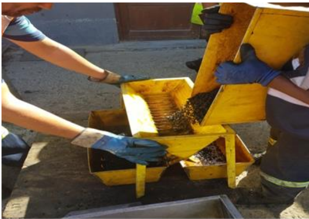
Photo 3 - Second splitting procedure