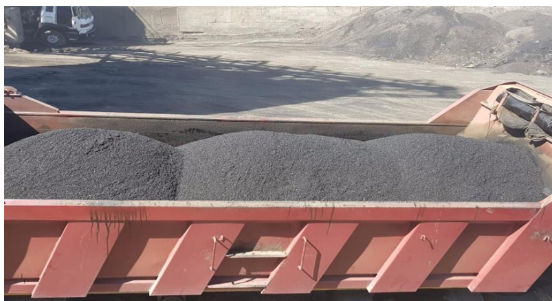
Figure A3: Typically Loaded Asphalt Delivery Vehicle (Three Piles from the Asphalt load-out hopper)