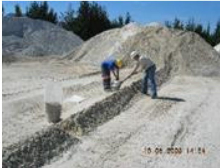
Samples of granular material being taken