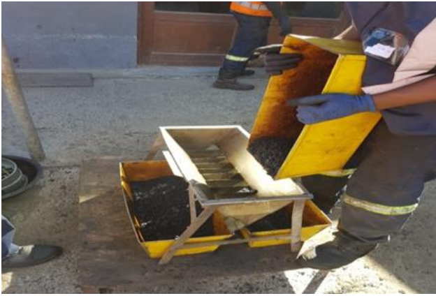
Photo 1 - Splitting the material in two equal halves