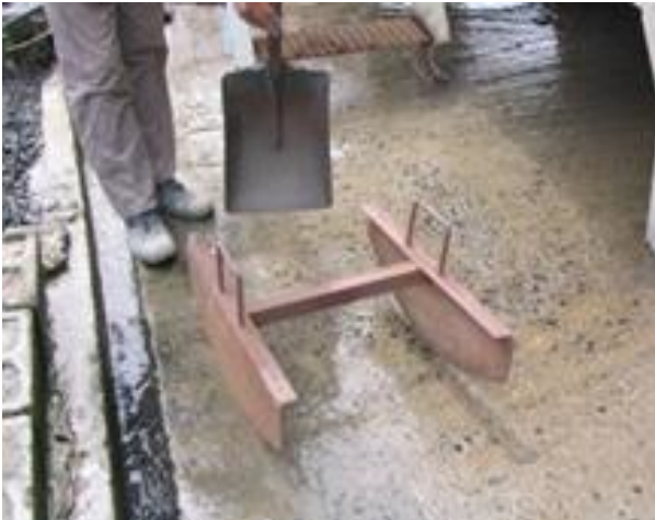
Shovel and Sample template (in shape of conveyor belt)