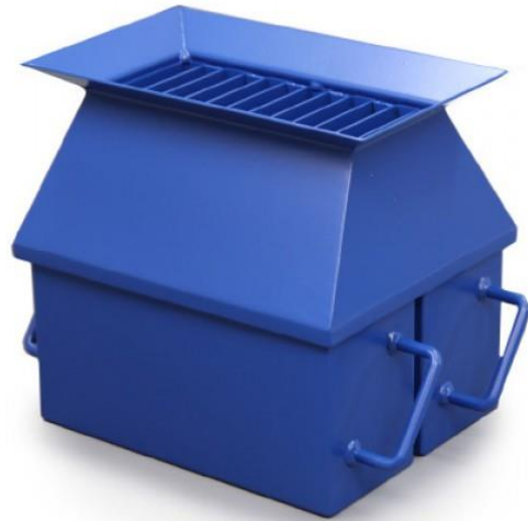
Figure A13(b) - closed system

Both the images above illustrate acceptable requirements besides in figure A13(b) where the pans would require handles & the pans need to be fixed to the frame in some manner.