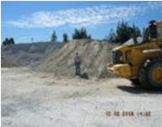
Front end loader flattening the stockpile

The primary sample should consist of at least 300 kg for coarse and 50 kg for fine materials. However, since it is impractical to transport such large quantities, the material is immediately divided up into the secondary sample size as shown in Table A1. The tertiary sample size is determined by the test method when the sample is in the laboratory.