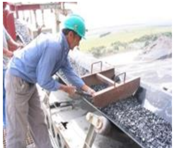
Commencement of sample extraction from conveyor belt