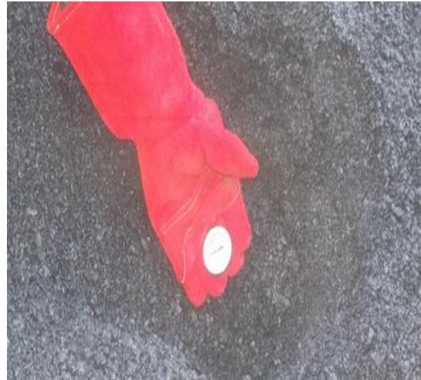
Figure A5: Dial-Gauge Temperature Device in Sample Hole