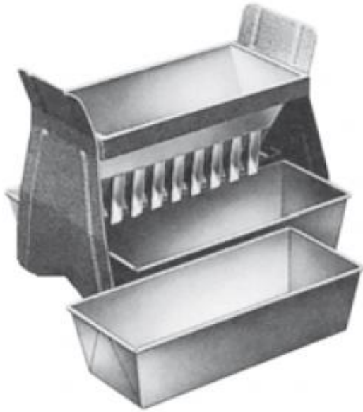
Figure A13(a) - open system