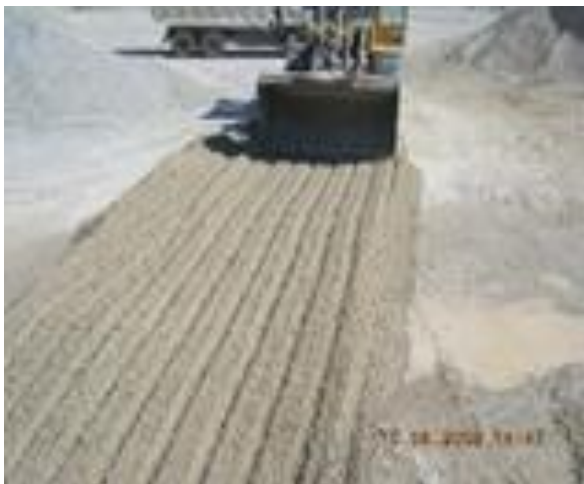
Front end loader levelling first load of granular material